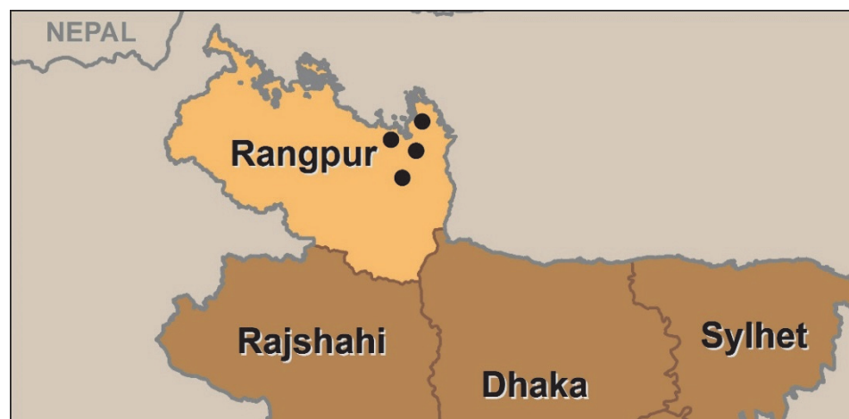
Figure 1. Map of study divisions and clusters

INDIA INDIA Dhaka Dhaka Dhaka Chittagong Khulna Barisal Bay of Bengal MYANMAR