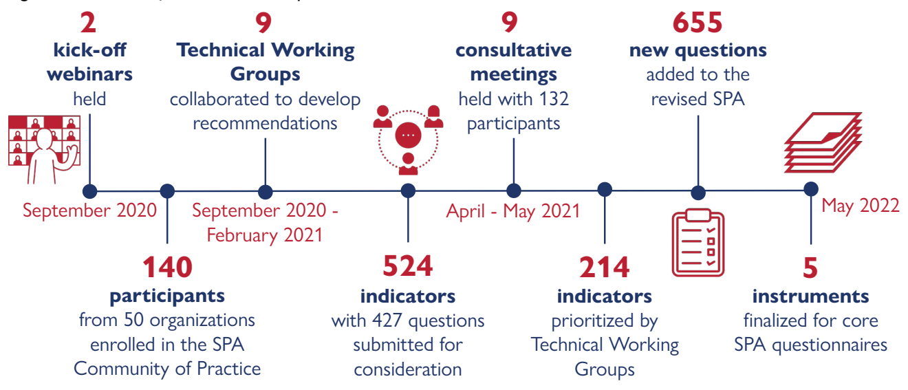
Figure 1. Timeline of the SPA revision process.